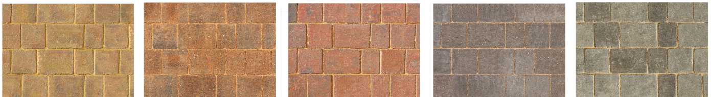
Autumn Gold (AG)